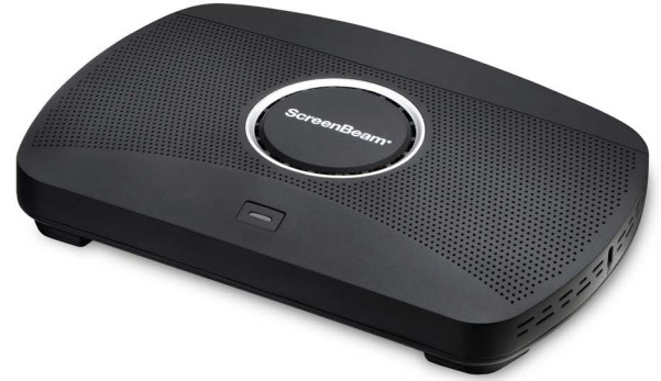
CATALOG NUMBER SBWD1100P ScreenBeam 1100 Plus Wireless Display Receiver with ScreenBeam CMS

Presenter and guest devices have multiple ways to connect including Miracast™, local Wi-Fi mode, and network infrastructure connectivity. New HDMI input reduces conference room complexity and costs by eliminating unnecessary equipment while making it easy for older devices without wireless display capability to connect and display. Windows and macOS users can share content in both duplicate and extended screen modes and Multi-View allows up to four client devices to share content on-screen simultaneously.